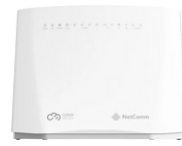
Upgraded NBN™ Modem NETCOMM NF20MESH

If your business does require a new modem send your old modem to Goodtel and we will arrange to have it recycled.