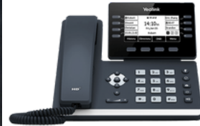
Desktop with Wi-fi YEALINK T53W Premium business phone