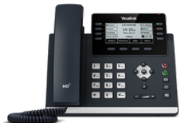
Desktop YEALINK T43U Perfect for general office use