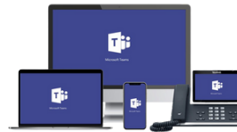
MS Teams Calling Microsoft solution Perfect for flexibility

ALL PLANS INCLUDE UNLIMITED CALLS FOR LOCAL, NATIONAL AND CALLS TO MOBILES IN AUSTRALIA