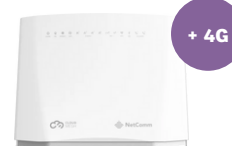
Upgraded Mesh Bundle Netcomm NF20MESH + 4G back up